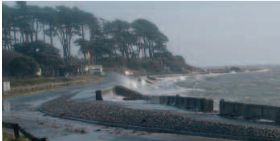
Lepe trees and seawall