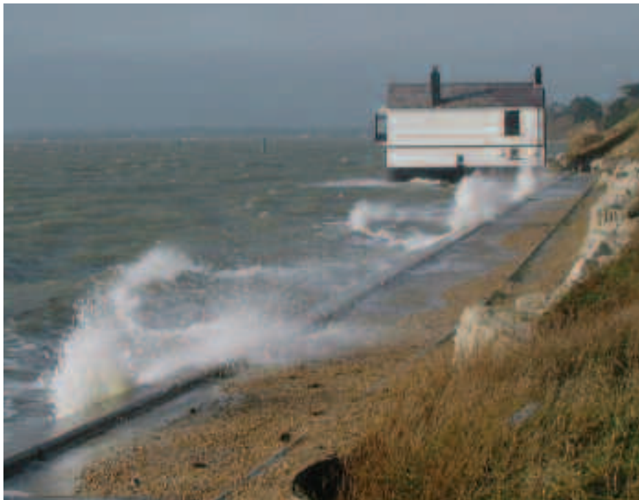
The Watch House at Lepe