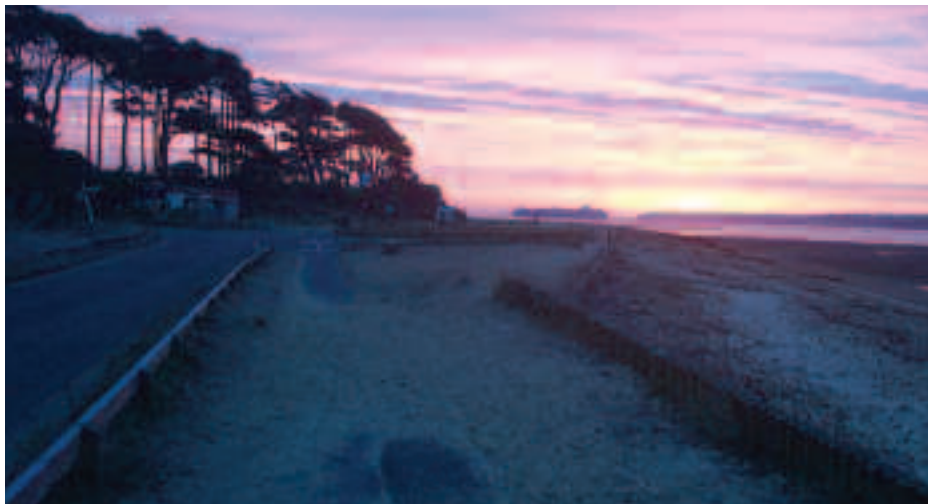
Sunrise at Lepe