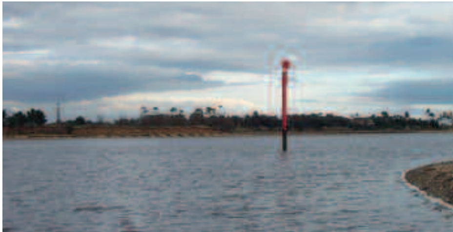
Beaulieu river entrance