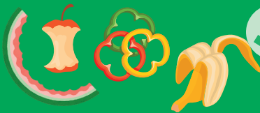
Fruit and vegetables Including peelings

These items can be raw or cooked, plate scrapings, uneaten food, out of date food, or mouldy food.