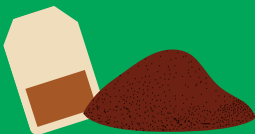
Tea bags and coffee grounds