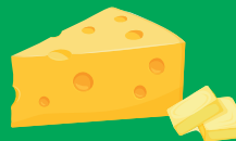
Solid dairy products

Your food waste will be recycled to create fertiliser and renewable energy.