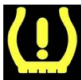
Diagram 1. Example of a TPMS warning lamp

The TPMS warning lamp (see diagram 1) can operate in many ways depending on the vehicle type. If it is clear that the lamp indicates a system malfunction it is a fail. If it indicates that one or more of the tyre pressures is low it is not a fail.