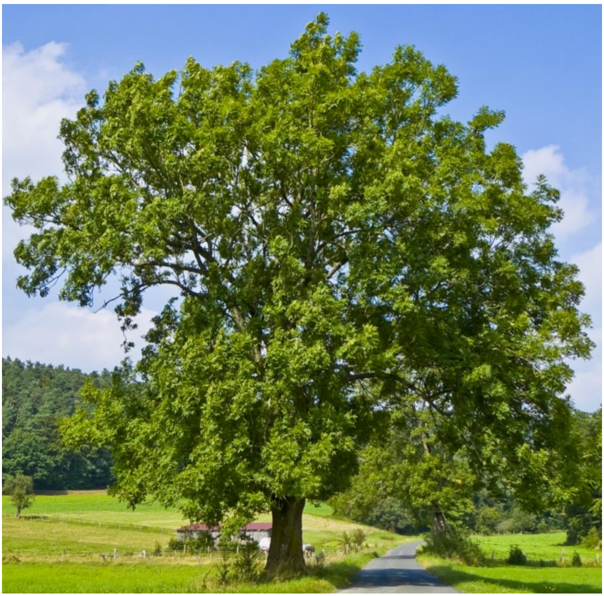
Ash Health Class 1 - 100% full canopy, Vitality Class 0:

Commission produced a book 'Assessment of Tree Condition' to enable a standard system for describing the condition of a tree based on the percentage of existing canopy remaining. Individual tree condition can be quantified using this 4-category framework, enabling data to be collected, and informing management interventions.