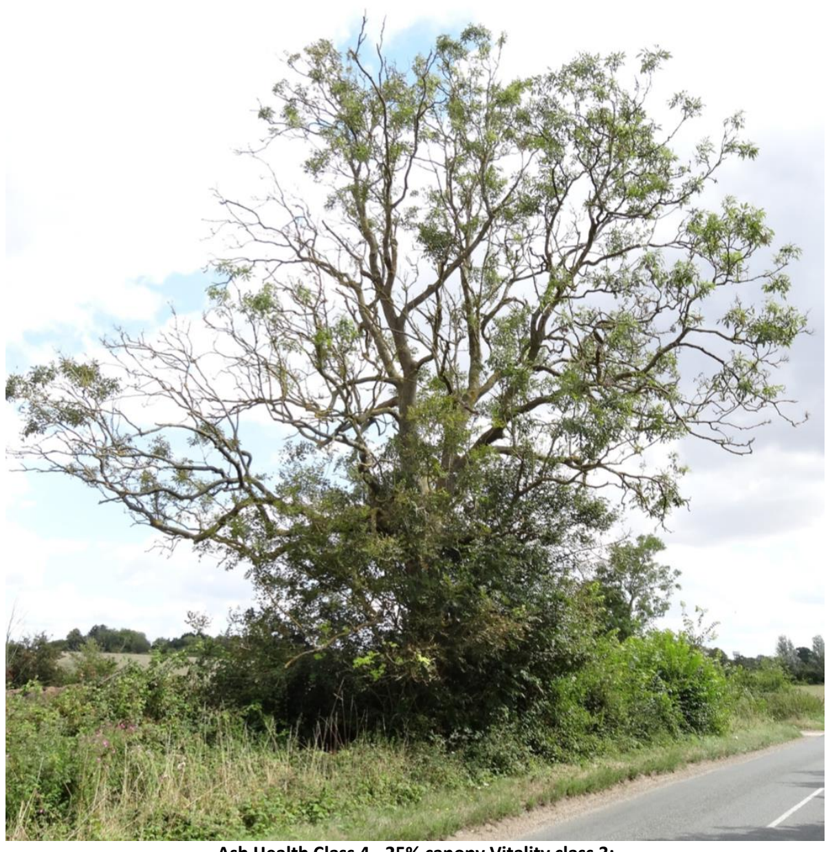
Ash Health Class 4 - 25% canopy Vitality class 3:

In considerably damaged or declining trees, the dieback of whole crown parts is evident, with the crown finally falling apart by breaking off larger branches. The tree seems to consist only of more or less surplus sub-crowns, dispersed randomly in the airspace and forming whip-like structures. The treetop is often dying back or is already dead, because the treetop shoots grew in the retraction phase.