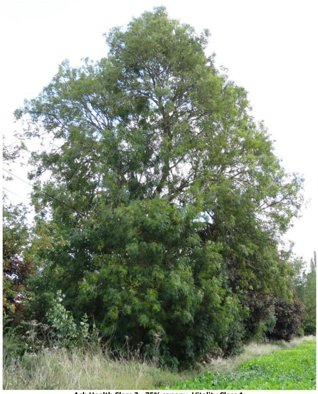
Ash Health Class 2 - 75% canopy, Vitality Class 1:

Weakened trees show treetop shoots in the degeneration phase. Thus, spears/"fox tails" are formed, rising above the canopy. The leaves on these spears are dense and grow all around them (at the top of the lateral short-shoots or shortshoot chains). The crowns make a frazzled impression on the outside, and have a fastigiated appearance, because the airspace between the spears is not completely filled by leaves and twigs, and the crown has a spiky outline. Inside the crown, the branching pattern, and hence the foliage, is quite dense. In this vitality class, straight percurrent main axes of the treetop branches are still dominant, but the crowns no longer look as intact as in class 0 because of the spears shooting out of the canopy.