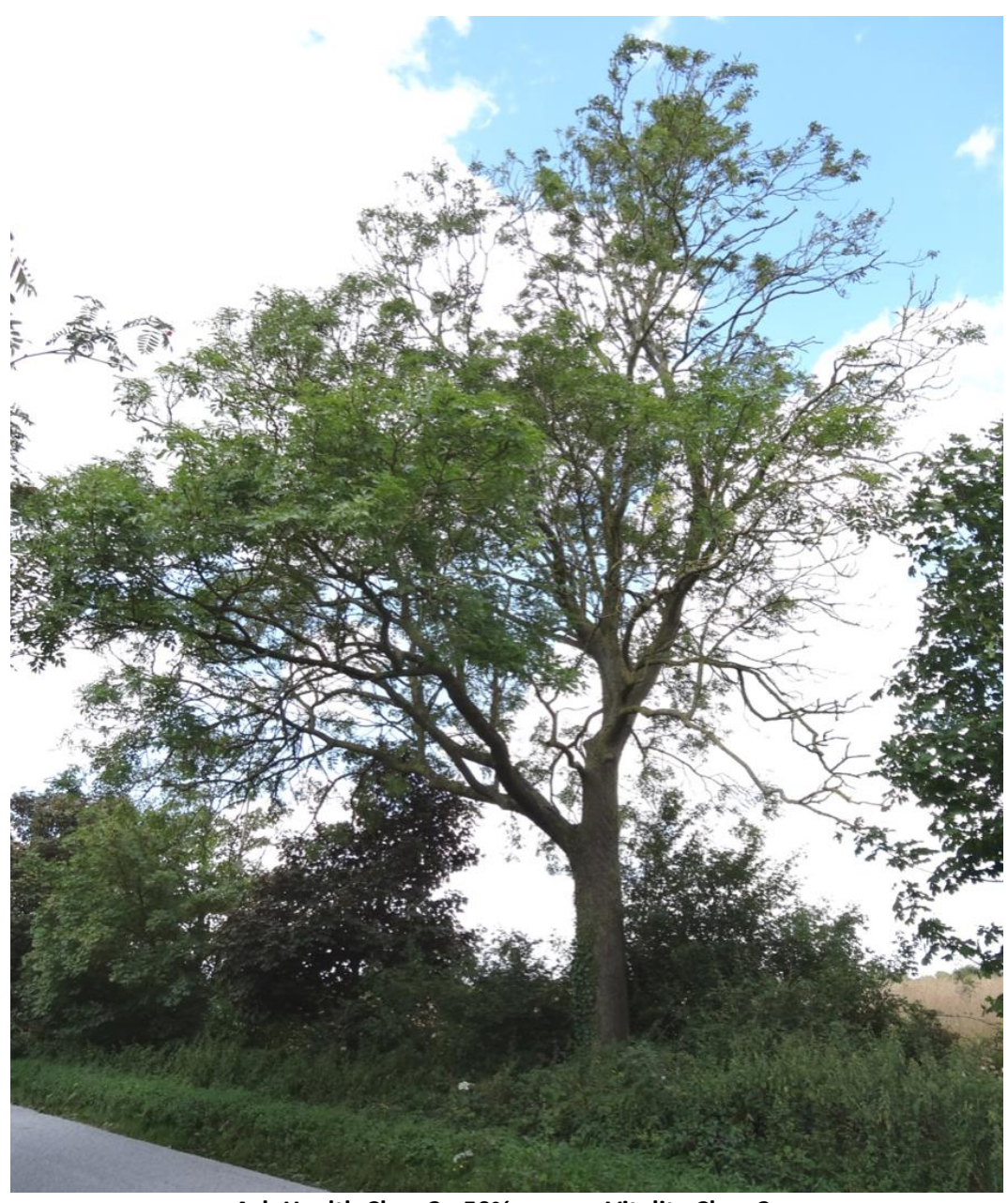
Ash Health Class 3 - 50% canopy Vitality Class 2:

In obviously less vigorous trees, the treetop shoots begin to build shortshoots in the stagnation phase. The leafless state could be designated as the claw stage, because the short-shoot chains in the outside of the crowns grow longer, are predominant, and stretch claw-like to the light. These short-shoot chains, growing too long, break off in summer in thunderstorms and heavy rains, and strew the forest floor in declining stands. Under normal circumstances, trees get rid of parts of their unimportant twigs in the inner and lower crown parts in this way. However, if the treetop shoots themselves are declining, the self-pruning of twigs progresses into the outskirts of the crown, and the crowns become thin from the inside outwards. The cause for this occurrence is not premature leaf fall, but broken short-shoot chains, a lack of shoots, and dead buds and twigs. The branching pattern shows a bushy and lumpy accumulation in the periphery of the crown. This accumulation causes summer and winter bushy crown structures and greater gaps. The crown periphery still has hardly any straight percurrent branches.